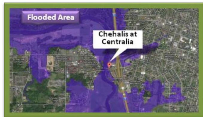
Chehalis River Basin Flood Authority: Flood Warning System Brief Sheet

The findings led to a plan for improving the identification of flood threats, agency coordination, and communication with the public. The plan included an Internet-based data collection, visualization, and dissemination tool plus additional rainfall, temperature and river monitoring stations to fill gaps in existing observation networks in the Chehalis River Basin.